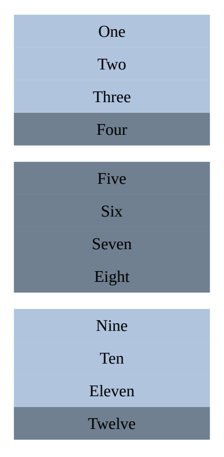
select the first three elements inside of every odd element

select elements that are the first child of their parent of the second element :nth-child(odd) li:nth-child(-n+3)